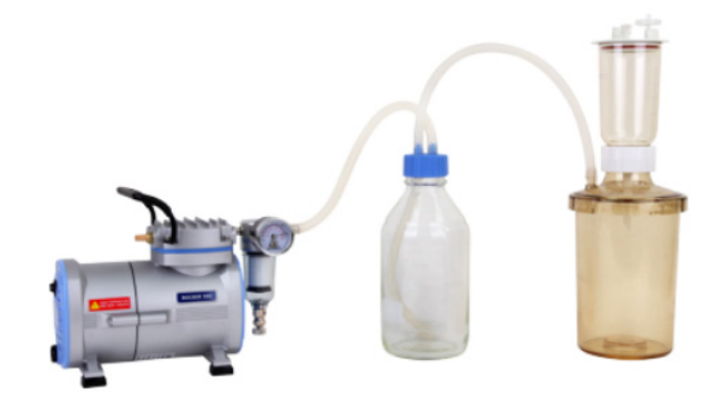
Using a safety bottle to prevent from overflowing